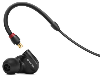
The IE 100 PRO features a low-profile mould and a reinforced ear-hook

“When you choose the IE 100 PRO Wireless, you get an outstanding two-in-one solution,” says product manager Gunnar Dirks. “In addition to the standard accessories, the IE 100 PRO Wireless includes the IE PRO BT Connector - simply unplug the standard cable, attach the lightweight semi-wireless cable instead and enjoy great audio with all the freedom of a Bluetooth connection!” A USB-C cable, which fully recharges the Bluetooth connector in 1.5 hrs is included, too.